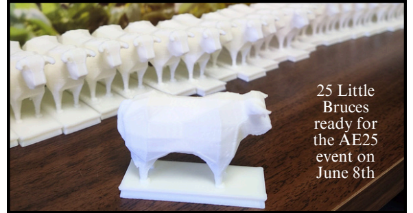
25 Little Bruces ready for the AE25 event on June 8th